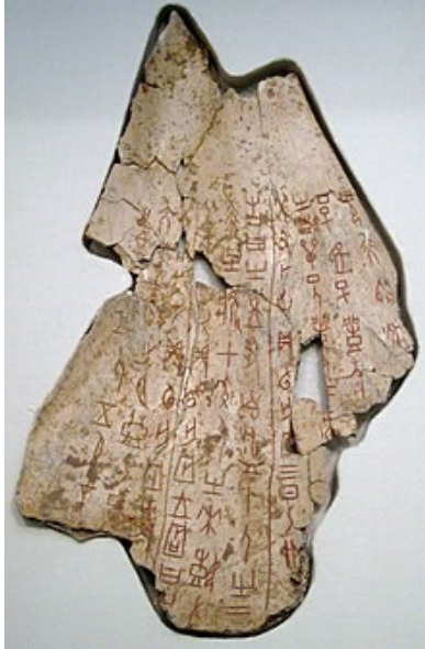
Dated: 1230 BC

Ken-ichi Takashima dates the earliest oracle bone inscriptions to 1230 BCE