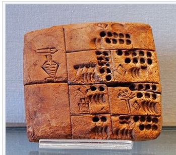
A Sumerian clay tablet potentially signed by Kushim in the upper left corner. Not the more well known "Kushim Tablet"